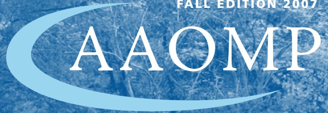
“HUDSON RIVER VALLEY FALL”