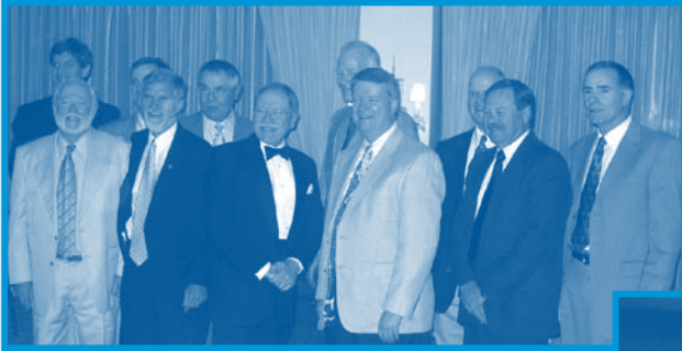
AAOMP Past Presidents